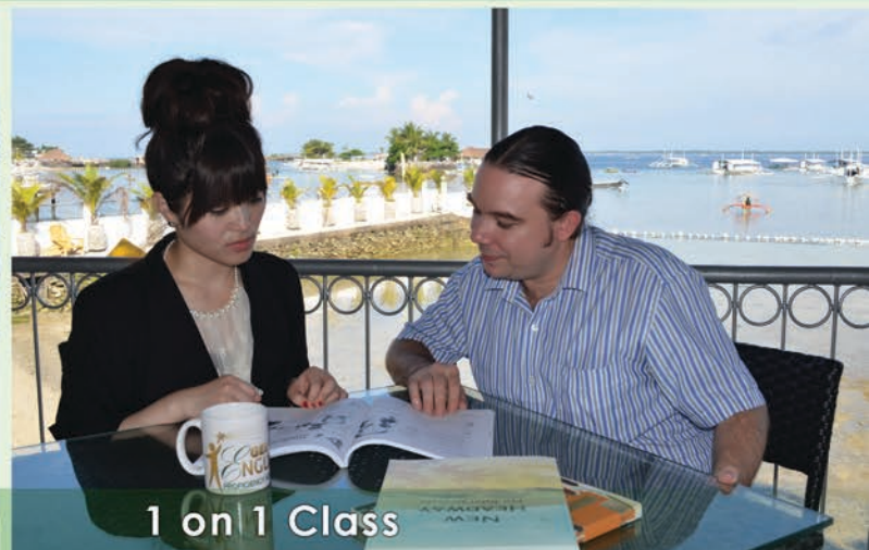
1 on 1 Class