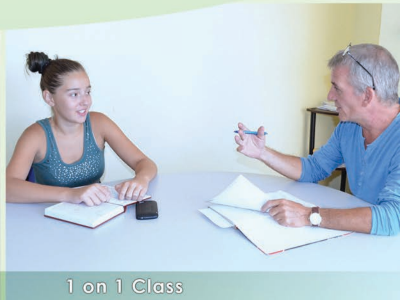
1 on 1 Class